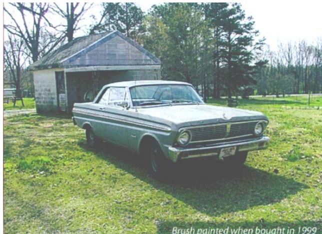
Brush painted when bought in 1999